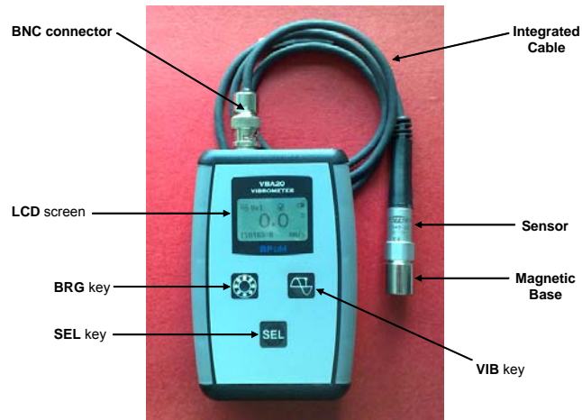
Figure 1. The VBA20