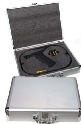
Package includes handy aluminum carrying case

Optional model with different length and tube size available: MFB series Contact you near agent for price detail.